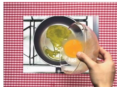
Film stills of the photo animations TOYOKORO, SKY BLUE and SCRAMBLED EGG by Maki Satake.

All participants of the workshop will also have the opportunity to visit the following events: